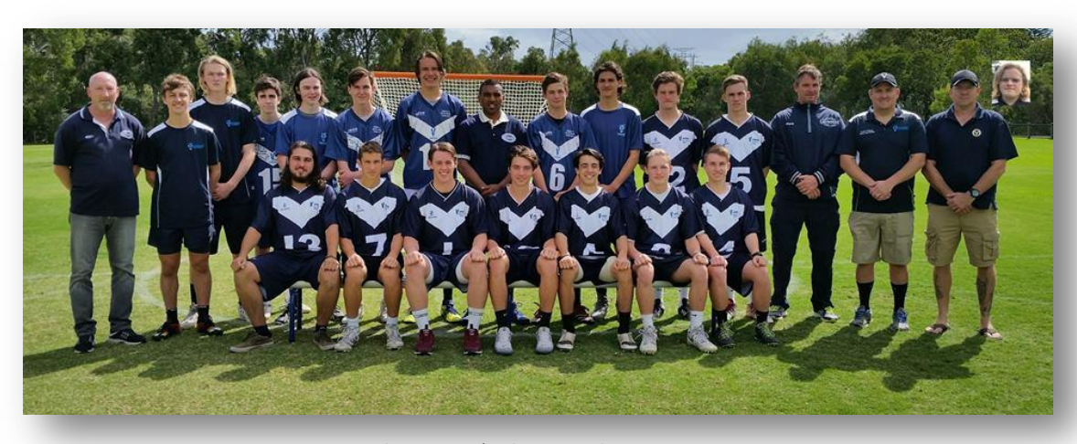
2017 Under 18 Men's Championship Winners – Victoria