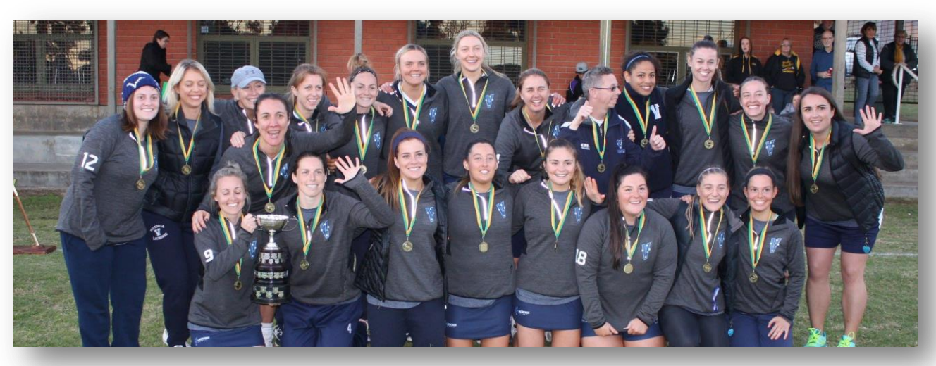
2017 Senior Women's Championship Winners – Victoria