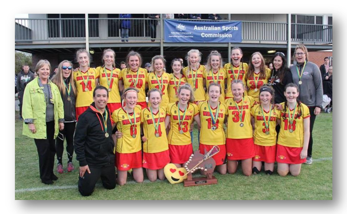
2017 Under 15 Girl's Tournament Winners – Waikato