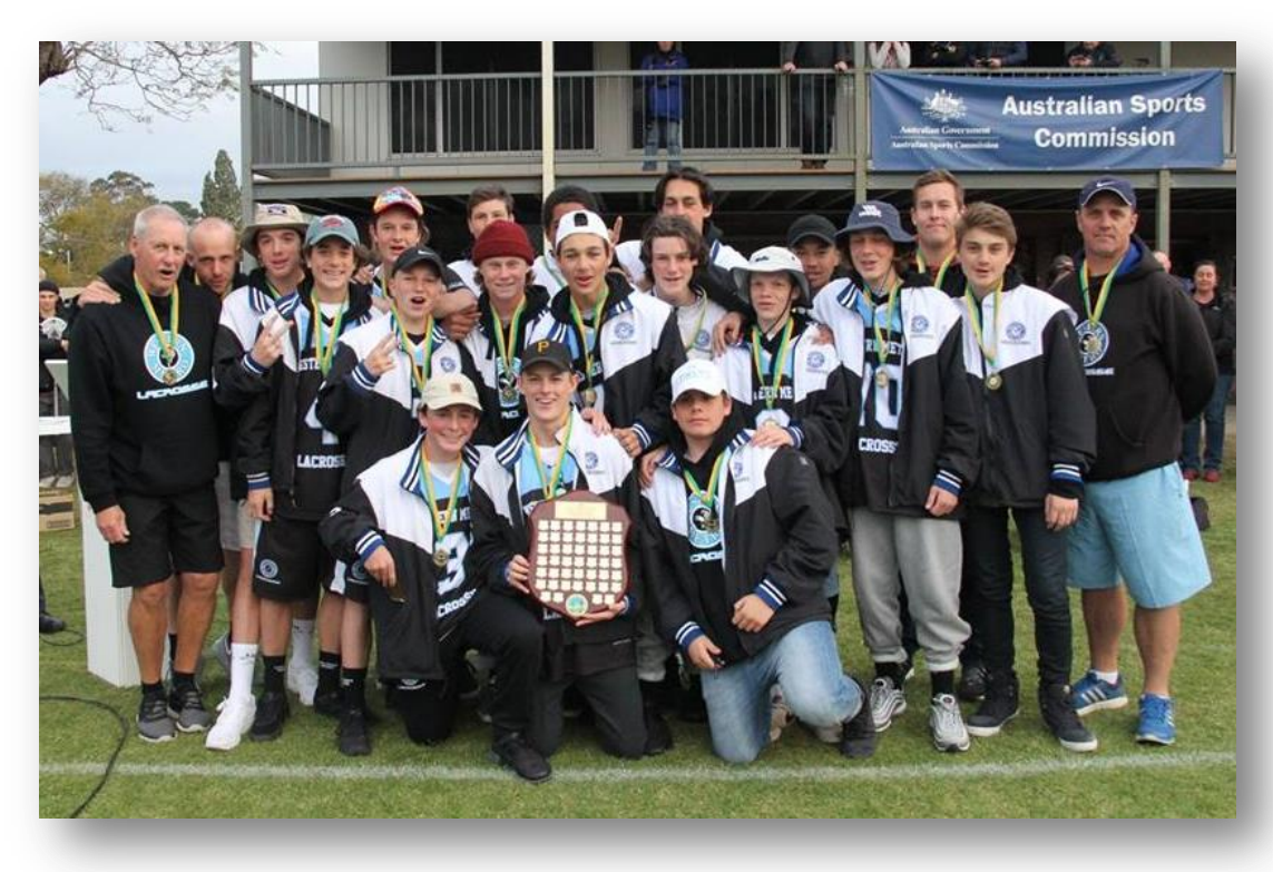
2017 Under 15 Boy's Tournament Winners – Western Metro