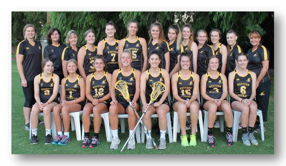
2017 Under 18 Women's Championship Winners – Western Australia