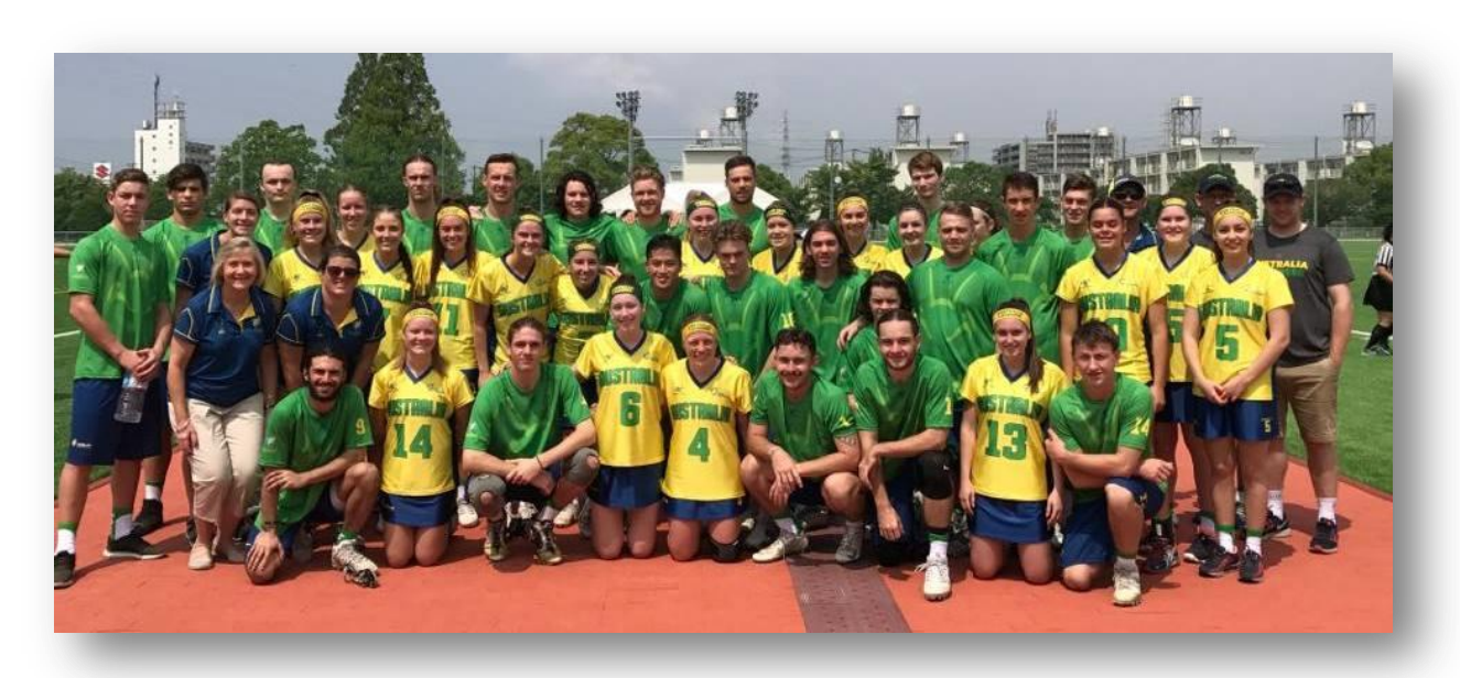
2017 Australian U23 Men's and Women's Teams