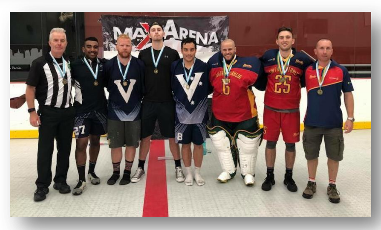
2017 Men's Indoor All Star Team