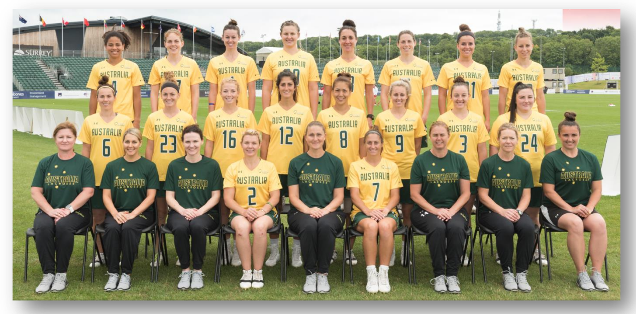
2017 Australian Women's Team