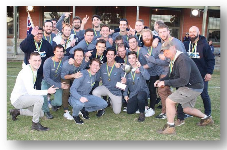
2017 Senior Men's Championship Winners – Victoria