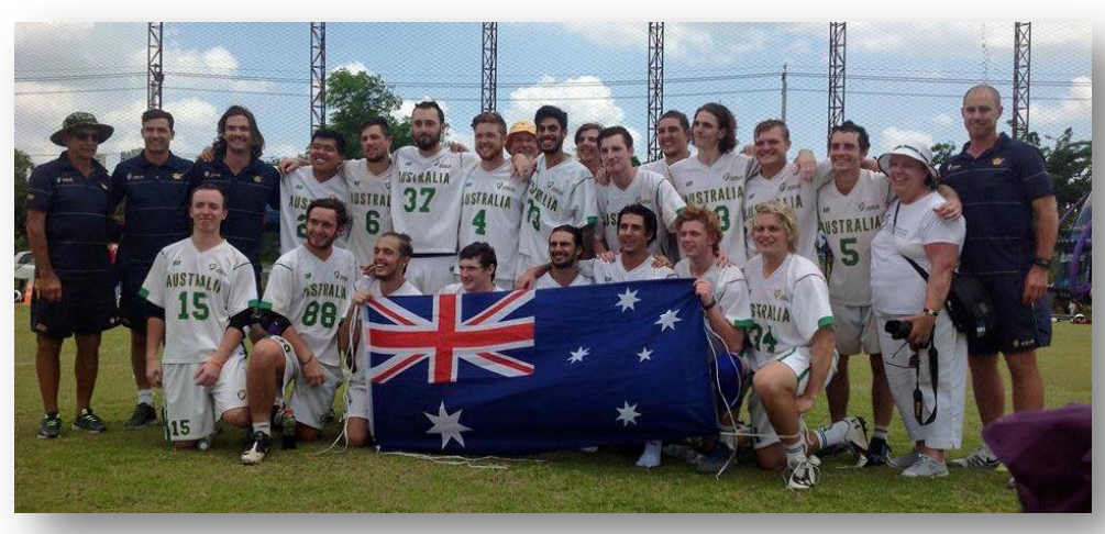
U23 Australian Men's Team 2015

Saturday 11<sup>th</sup> July BRONZE MEDAL GAME: Australia 16 def Hong Kong 10