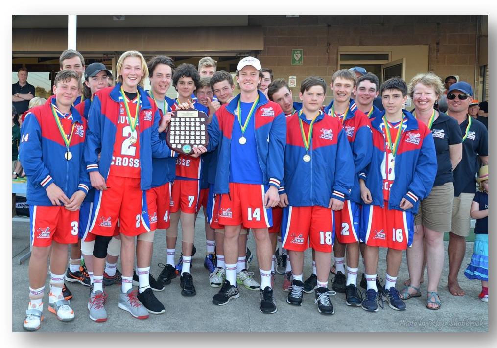
2015 U15 Boy's Tournament Winners – VIC Southern Crosse