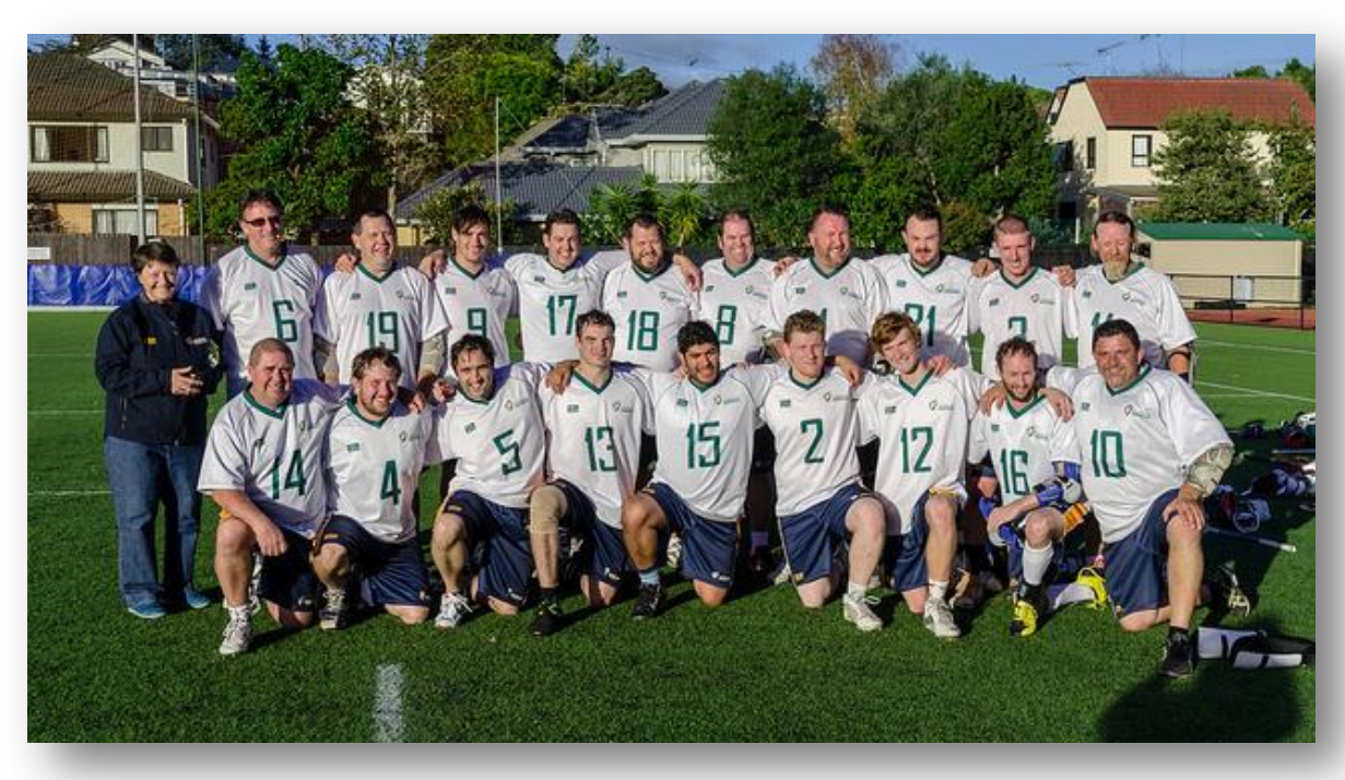
ALA Men's Representative Team 2015

Saturday 25<sup>th</sup> April Australia 3 lost to New Zealand 9 Sunday 26<sup>th</sup> April Australia 7 drew with New Zealand 7