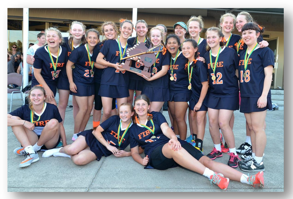
2015 U15 Girl's Tournament Winners – VIC Fire